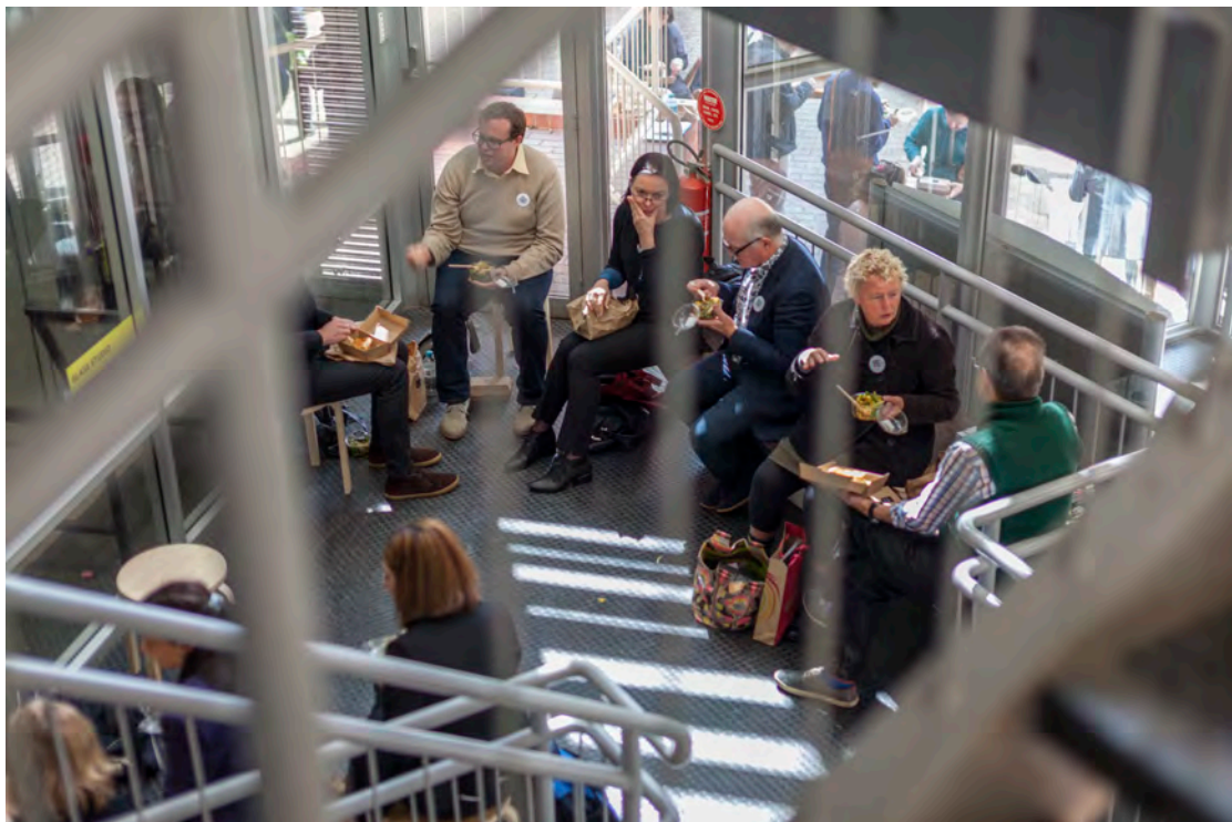
2015 conference delegates, University of South Australia

Since its inception as an informal Sydney conference meeting, ACUADS has provided an organised network of art and design Heads of School, Deans, Directors and colleagues, providing support and direction for the art and design education sector. ACUADS has grown to become the authoritative voice and peak discipline body of visual art, craft and design education professionals. ACUADS promotes quality professional education, fosters research in art, craft and design education and advocates for the sector. ACUADS' development continues to be informed by international concerns, local policies and the ongoing need for a national communication network.