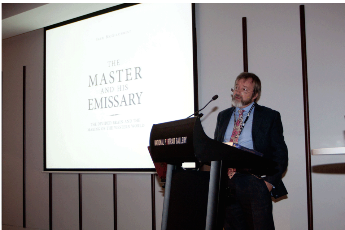
2011 Conference Keynote, Dr Iain McGilchrist, Australian National University