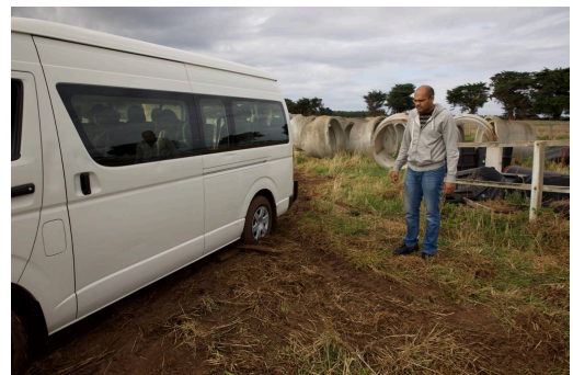
Treatment Bus bogged, photo: Megan Evans