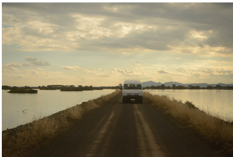
Treatment Bus , Western Treatment Plant, 2017.

If we understand place as an unstable, shifting set of political, social, economic and material relations, and locality as produced and contested through a set of conditions that we might describe as a situation, our experience of works which truly produce remarkable engagements with place will be characterized by a sense of dislocation – encouraging us no longer to look with the eyes of a tourist, but to become implicated ... (Doherty, 2009, 18)