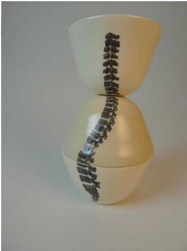
Fig. 1. Henrietta Farrelly-Barnett, Psychonotis microphylla rivularis , 2017. Black underglaze, stoneware, dimensions various.

technical skills to make ceramics. Less obvious, perhaps, is how the work displays knowledge of the material history of ceramics and how our encounters with objects of art can generate affect. The three bone-white ceramic bowls, each decorated with an anatomical drawing of a partial vertebral column, forms an image of a complete spine when stacked and aligned in a specific way. The display of the bowls in a tower of interconnected units suggests the vertebrae stacked upon one another, balanced to hold the body upright, but also to allow for rotation, flex and extension of the spine.