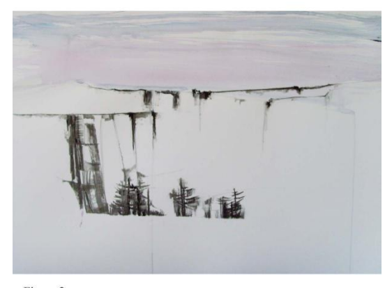
Figure 2 'Niederau' - Graphitem Charcoal, pastel and watercolour on Fabriano

Exploration, within the drawings, attempts to capture the essence of the experience of 'being there', within a few, seemingly deliberate, strokes of graphite; the marks expanding, within the areas of positive and negative space, to express and interpret the uncertainty of this temporal