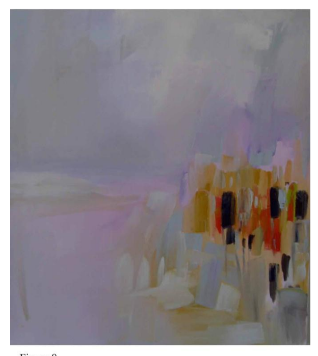
Figure 8 'Singularity'

Thus, it is possible to say that, as time passes through all 'Dasein' (Heidegger, 1962), as Being-in-the-world, the subject or being, recreates the world, or grasps it, through its temporality (Zeitlichkeit). In grasping, our understanding reveals that