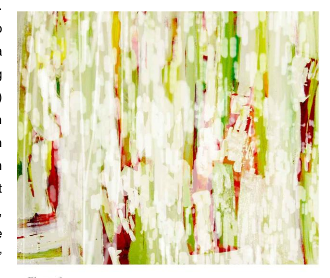
Figure 6 'Bremen 2010' - Layered digital drawing on Arches

experience of drawing in the landscape. Embodied knowledge retreats subliminal memory, utilised as foundation for intuition within drawing Bachelard's (1884 proposition that the mind is given form through the places and spaces in which we dwell, reinforcing this reciprocity in that, it is those places themselves, that shape and influence our memories, feelings and thoughts; '...Je suis l'espace où je suis (I am the space where I am)...' (Bachelard, 1994; 137).