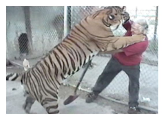
Figure 10 Figure 11

'The best' animals, 'the best' exotic and I would argue 'the best' arts educators / artists, aren't determined by a just add Florida mentality, they are a consequence of an attunement with the complexities of habitat. I am not proposing we bite the hand that feeds for opposing the conditions that have created this supportive context (where we are desired) would be ridiculous (if not impossible). However in striving for a real experience, a substance over surface, we need to communicate and preserve what constitutes our habitat, a real experience for us; what environment enables us as an artist / art educator species to flourish and evolve. The Surrealists 'developed relationships with prominent indigenous people... It was as a result of such contacts that [they] critically reframed their early...representations of the 'primitive'. (Tythacott, 2003:12) Contextualised as a creative, contemporary exotic, we need to reverse the roles, take the initiative and work harder at encouraging the powers that be to critically reframe their understanding of what we constitute.