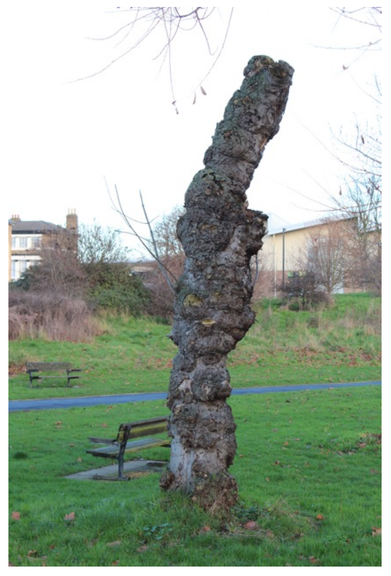
Figure 1: Bridget Currie, Trees Among People (ongoing) used with permission of the artist.

The human-to-tree actions documented by Currie remember powerful physical acts where the trees chosen have assumed new shapes in response. All of the trees photographed by Currie present fascinating sculptural form: they are gnarled, bumpy, and lopsided or sprout limbs asymmetrically. The scale and positioning of the treeforms are reminiscent of monumental public sculpture, and this is an associative connection that is reinforced by their situation in public parks where they perhaps stand as powerful urban memorials to "nature". Some of the trees remain alive in a traditional sense (with new foliage and limbs growing) while others are better described as large stumps, carved with a chainsaw. In her making, Currie traverses an uncertain line between the organic unfolding of nature and human-tree becomings. I suggest that the work pursues a question as to what intervolves in the relations between people and plants. As did Dali /Brassai in the Involuntary