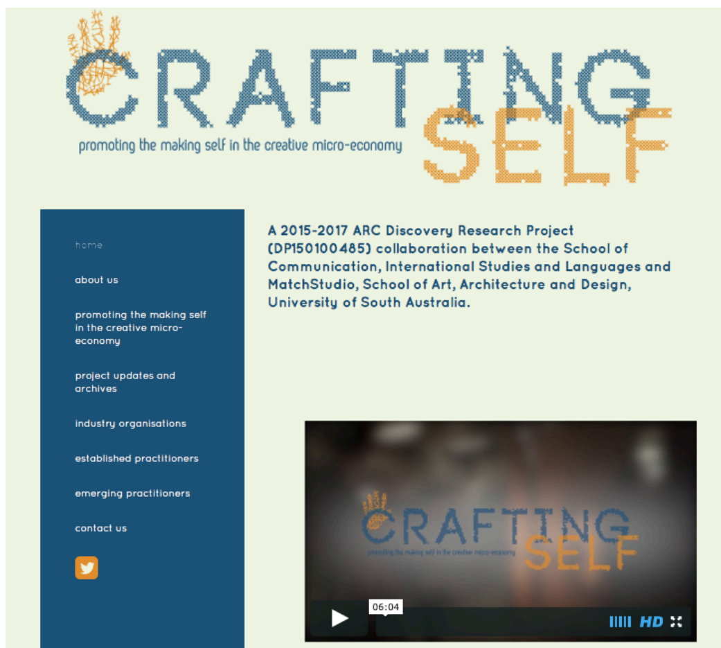
Figure 1 – Screenshot of Project Webpage ( www.unisa.edu.au/craftingself )

However, despite or indeed because of these opportunities, the ease of establishing online shopfronts hides the complex work required to start and run a creative small business practice, especially one in an increasingly globally competitive space with isolated producers and narrow profit margins. This raises new challenges for craftspeople and designer-makers, who not only require practice-based skills but new entrepreneurial skill-sets—both technical and personal—to operate successfully as a micro-enterprise in this emerging global market. Therefore employing methods including semi-structured interviews with established handmade producers, 1-Up monitoring of design graduates and new design craft businesses across 3 years to longitudinally analyse the contemporary experience of establishing a creative career post-graduation, and a historical mapping of Australia’s arts and crafts support organisations, a key research question underpinning this project is: what are the self-making skills required to succeed in this competitive environment?