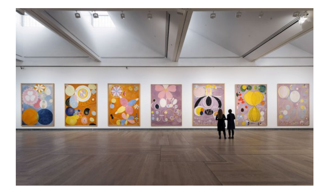
Figure 1 Installation view, Hilma af Klint – A Pioneer of Abstraction, Moderna Museet, Stockholm, 2013

Although the meaning of af Klint's work remains obscure, her studio methodology endows her work with a mysterious authority; their aspirations are not confected. Whereas other early abstractionists operated consciously according to a shared ideology, af Klint worked unconsciously, using psychic automatism to access the astral realm. She says: 'The pictures were painted directly through me, without any preliminary drawings and with great force. I had no idea what the paintings were supposed to depict; nevertheless, I worked swiftly and surely, without changing a single brushstroke' (af Klint, cited in Higgins 2013). As UK critic Adrian Searle (2006) observes, 'There is no irony whatsoever in af Klint's painting, no consistency and no self-reflection...' What for other abstractionists 'was a generalised utopian spirit, for Af Klint was a matter of personal psychic survival'.