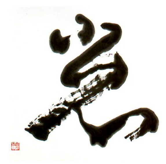
Figure 7 Tairiku Teshima, Hikari (Light), 2009

If we define spirit as that which is non-material, originating form an unseen, unlimited and currently unexplainable source, then spirit moves from this unlimited source through the artist's own emotions and cognitive structures into the material realm both as art making and as art.